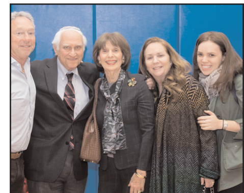
KJ camaraderie in action