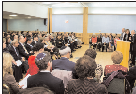
An attentive audience

Century Kehilah” and the power of building strong, interconnected communities. He spoke of the challenges