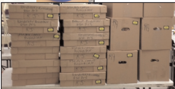
How many challah rolls and rugelach does it take to feed a Street Fair?

strategically placed right in the middle of Third Avenue was a huge draw. As the day ended, a crowd gathered around to sing